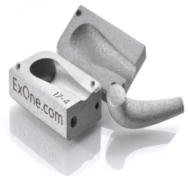
17-4PH Printed Part